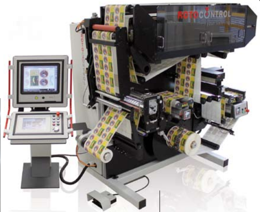
A RotoControl RSP single pass 100% security inspection machine has been installed at Advanced Labels in Durban.

This order was placed through Pascal Aengenvoort.