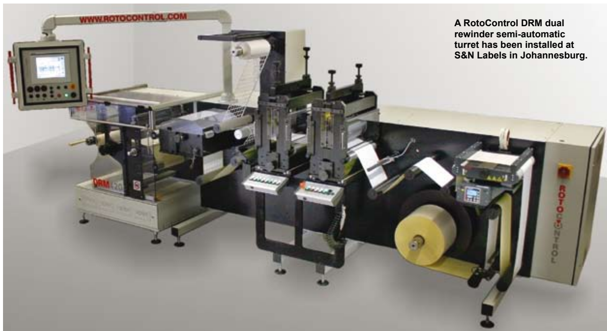
A RotoControl DRM dual rewinder semi-automatic turret has been installed at S&N Labels in Johannesburg.