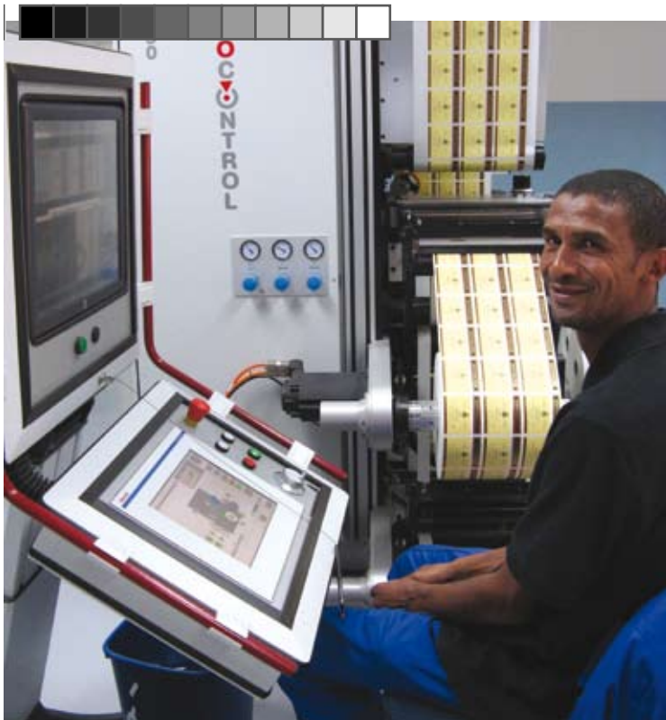
In March this year, SA Litho installed three RotoControl RSC 340 slitter rewinders, complete with AVT Helios 100% inspection systems.

this 100% vision inspection is paramount. 'The AVT systems give us total confidence in the integrity of these critical labels,' Leon adds.