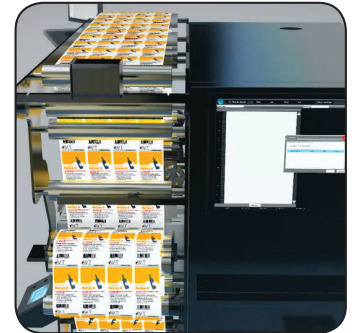
Rewinder station with WorkFlow Link

AVT LTD. 6 Hanagar St. P.O.B. 7295 Hod-Hasharon 45241 Israel Tel. +972 9 761 4444 Fax. +972 9 761 4555