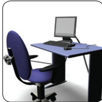
PrintFlow Manager editing station (optional)